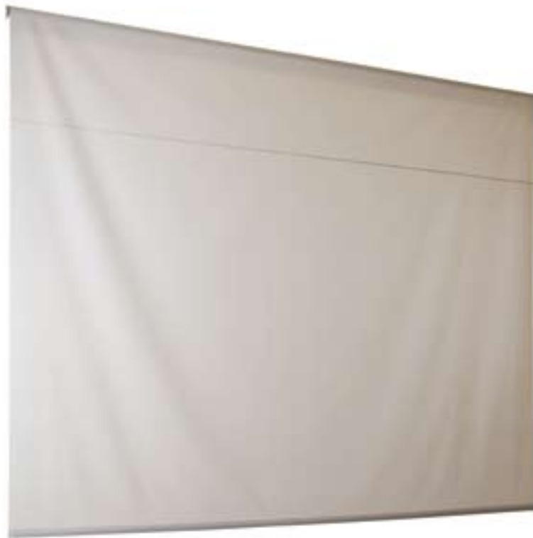
Figure 7 - Same shade with reduced deflection and a batten