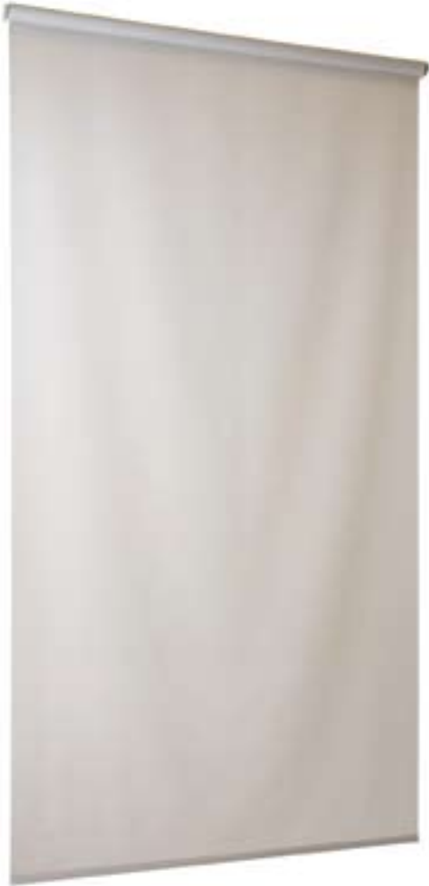
Figure 1 - Tall, Narrow Shade